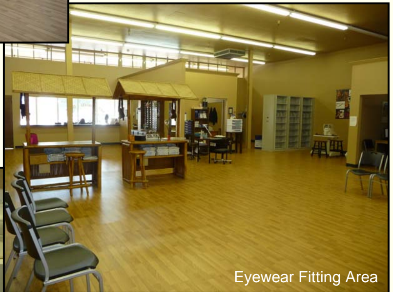
Eyewear Fitting Area