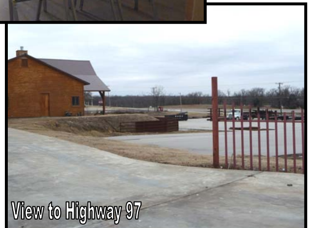
View to Highway 97

BEACON COMMERCIAL GROUP, LTD 8242 South Harvard, Suite I Tulsa, OK 74137