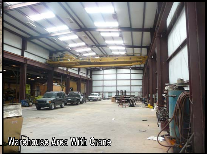
Warehouse Area With Crane