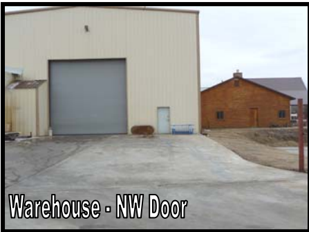
Warehouse - NW Door