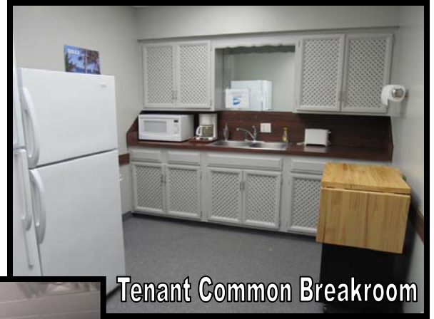
Tenant Common Breakroom