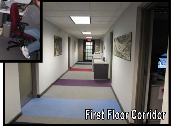
First Floor Corridor