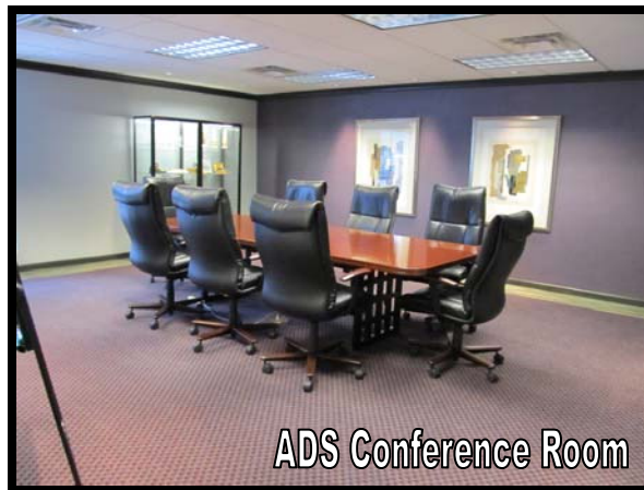
ADS Conference Room