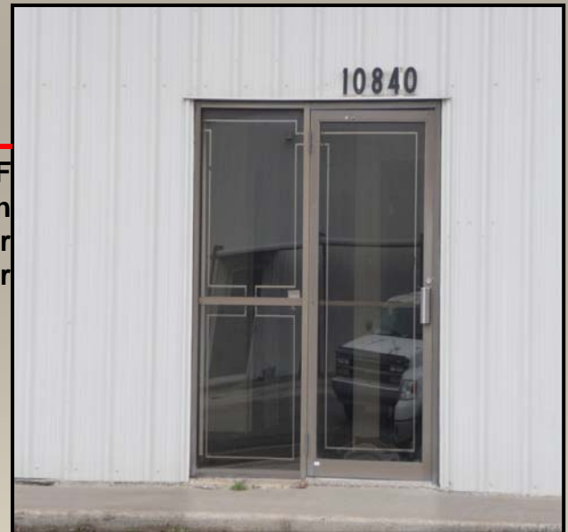
10840 East Newton Place

1,500 SF – Total HVAC $700/Month $30/Month/Water One 10' Overhead Door Dropped Ceiling in Warehouse