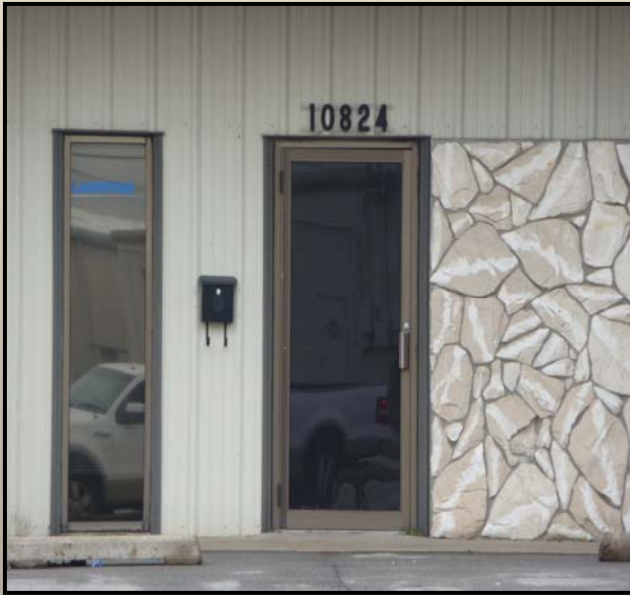
10824 East Newton Place

Easy access to Highway 169 and Interstate 44 Near Tulsa International Airport